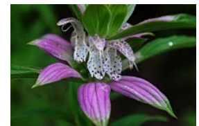
Spotted beebalm; dotted horsemint (Monarda punctata, Lamiaceae) Native