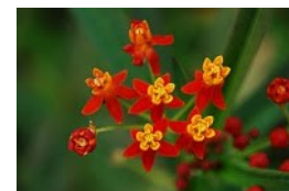
Scarlet milkweed ( Asclepias curassavica , Apocynaceae) Not native

Free quotes for Diana Shores homeowners!